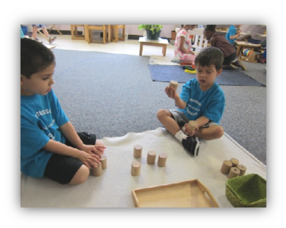
<u>Baric Cylinders</u> (Refinement of the baric sense)