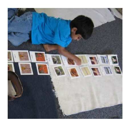
Three-part cards (Vocabulary development; the ability to abstract and symbolize)