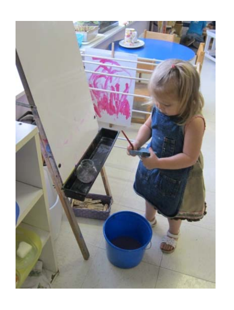
Cleaning after painting