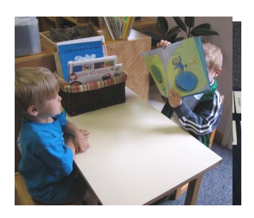
Reading to the younger friend (Reading and listening skills)