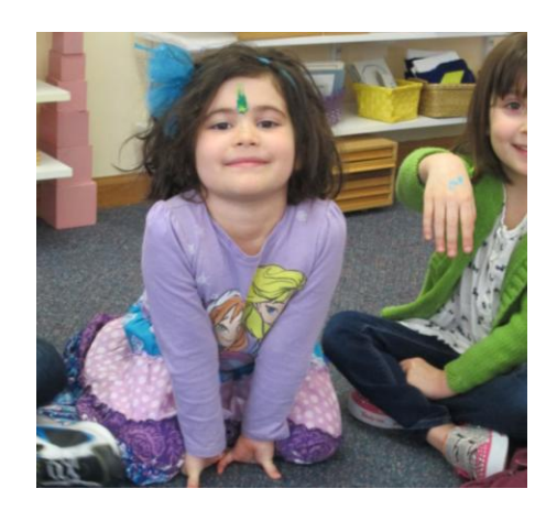
Continued on the next page