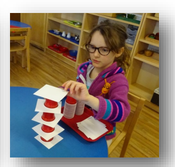
For St. Patrick's Day we discovered where Ireland is, and story of St. Patrick. In the math area the children counted gold coins 1-10, practiced pin poking and cutting out shamrocks, strengthening fine motor skills.

They created rainbows, pots of gold, and marble painting three leaf clovers.