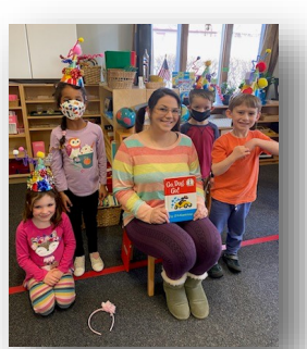
"The Lorax" the children made paper tissue Truffle trees. Painting with a mini car and making crazy fun party hats for "Go Dog Go!"