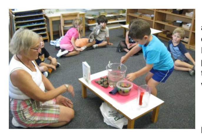
looking for his family.

One of the students thought that the water would turn orange. But it didn't.