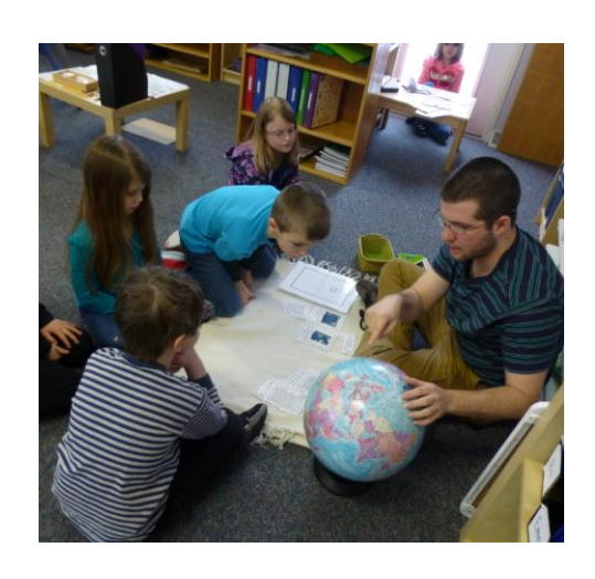
Continued on the next page