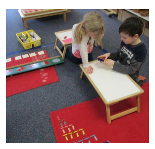
Continued on the next page