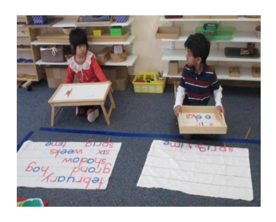
Continued on the next page