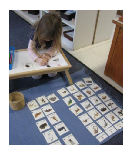
Continued on the next page