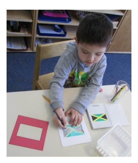
Happy springtime to everyone,