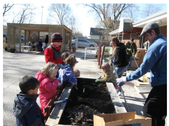
Continued on the next page