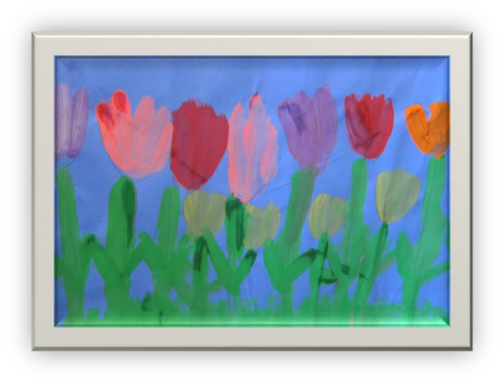
"My Tulip Garden" by Elena- South room

"The secret of good teaching is to regard the child's intelligence as a fertile field in which seeds maybe sown to grow under the heat of flaming imagination"